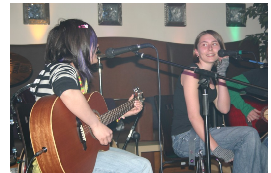
Young volunteers from West Lothian Youth Action Project