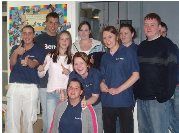
Sure Start Peer Educators with their volunteer 'guinea pigs' after a training session

For some young people, volunteering is simply a way to make new friends. For others it is a chance to learn something new and get a current reference.