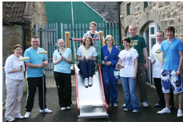
HM Tax Credit Employees enjoying their team challenge

Team challenges can be seen as a cost effective team building exercise with short, sharp visible outcomes. They also provide excellent PR opportunities, being easy to report, whilst photos of employees painting and gardening make good news stories and look impressive in company literature.